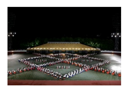
Song and Dance Festivals